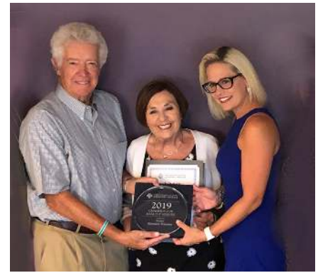
Great to present Senator Kyrsten Sinema with the Champion For Healthy Seniors award. She has been a wonderful leader on issues important to the cancer caregiver community.